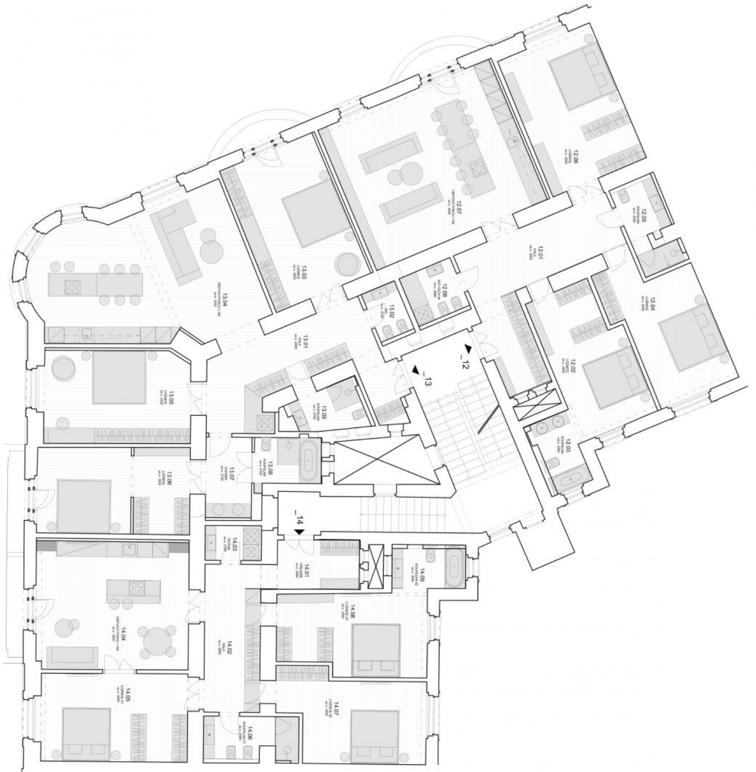
Dvč č. 12_4kk